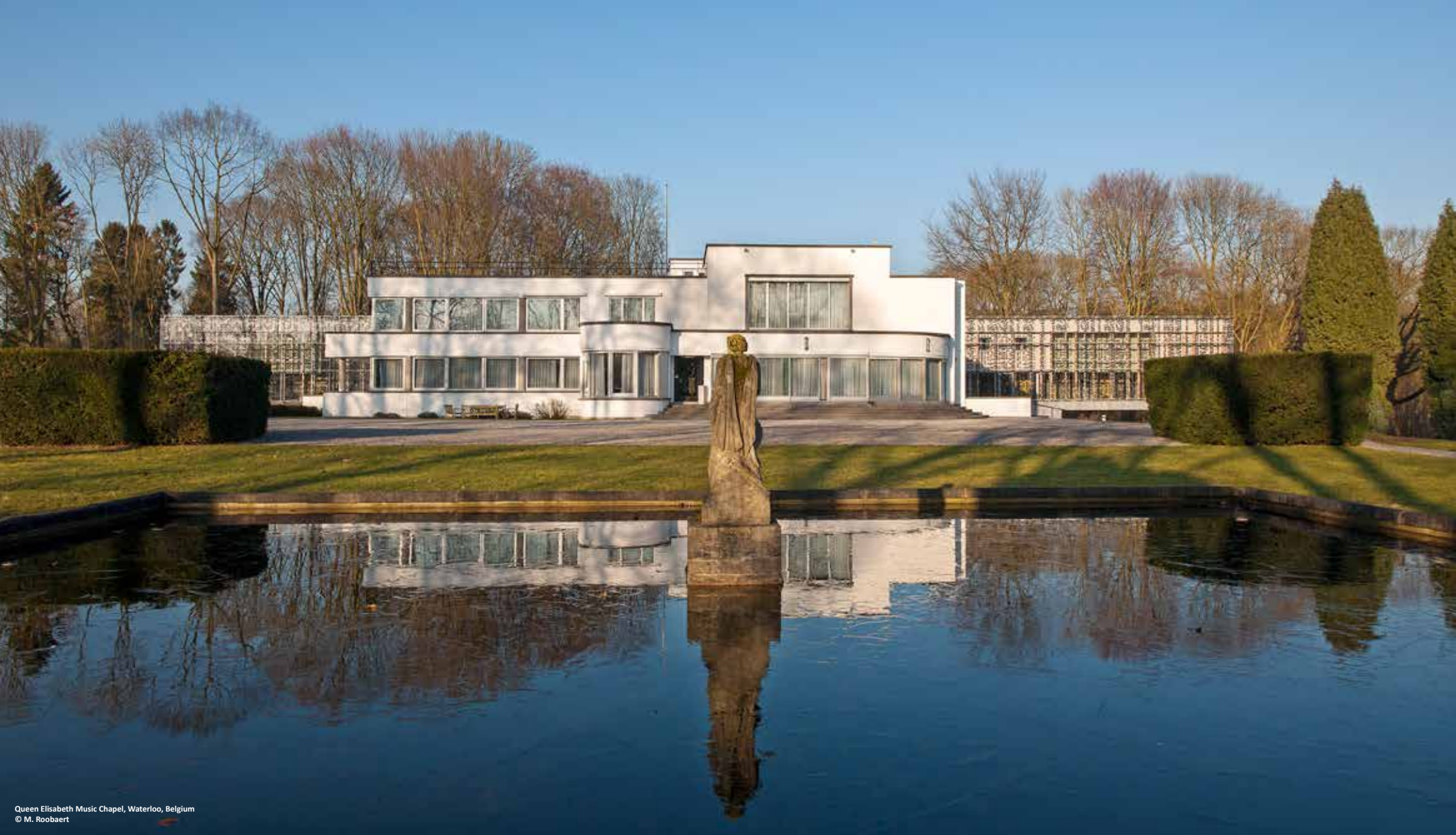
Queen Elisabeth Music Chapel, Waterloo, Belgium